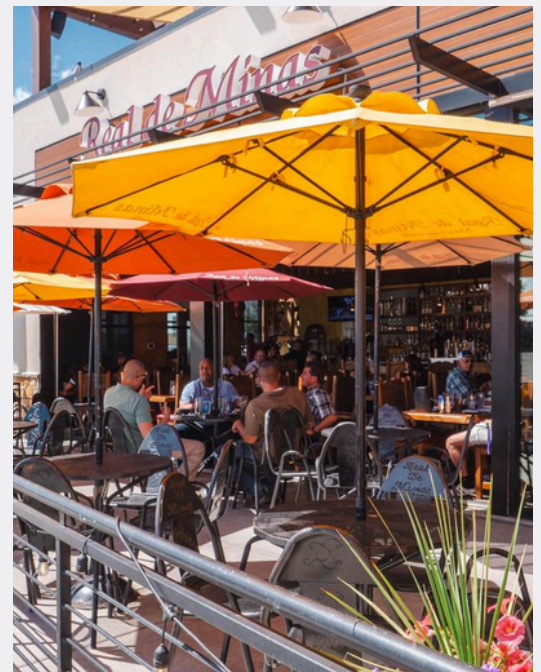
REAL DE MINAS

Taking over the former Old Chicago, this family-style Mexican restaurant will serve authentic dishes inspired by traditional recipes.