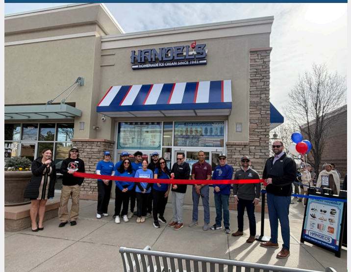
HANDEL'S RIBBON CUTTING