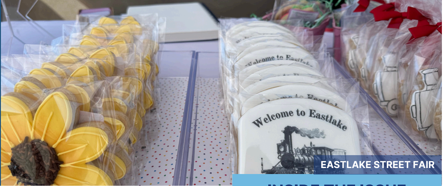
EASTLAKE STREET FAIR