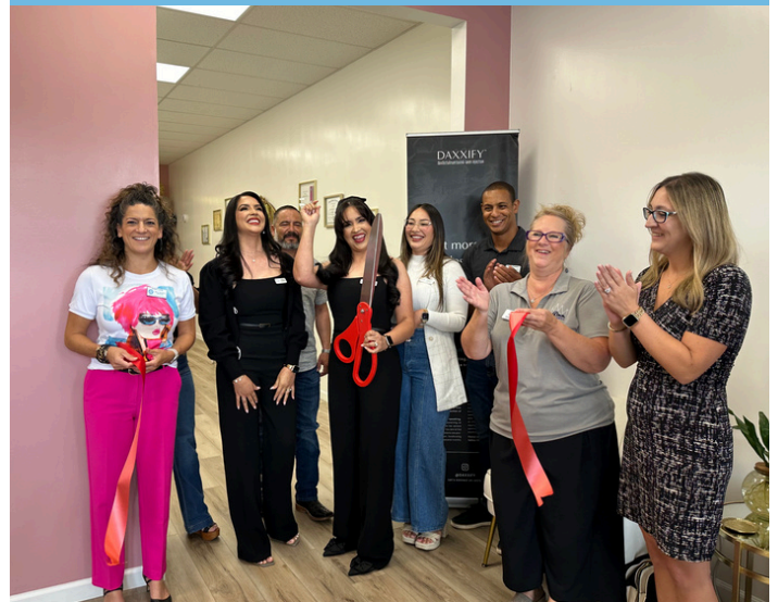
COQUETTE AESTHETICS & MED SPA