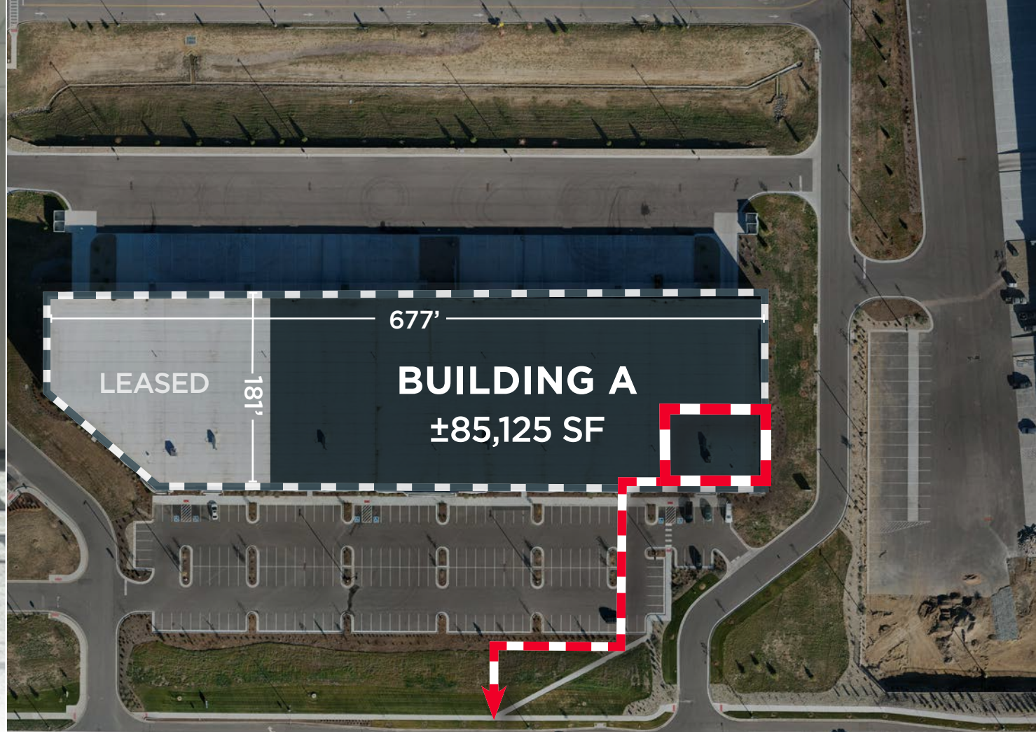
Building A Spec Office | 2,900 SF