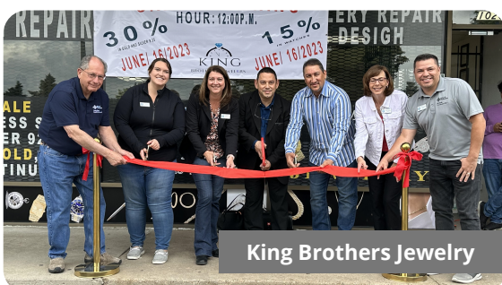
King Brothers Jewelry

King Brothers' is now open on 10265 Washington St.