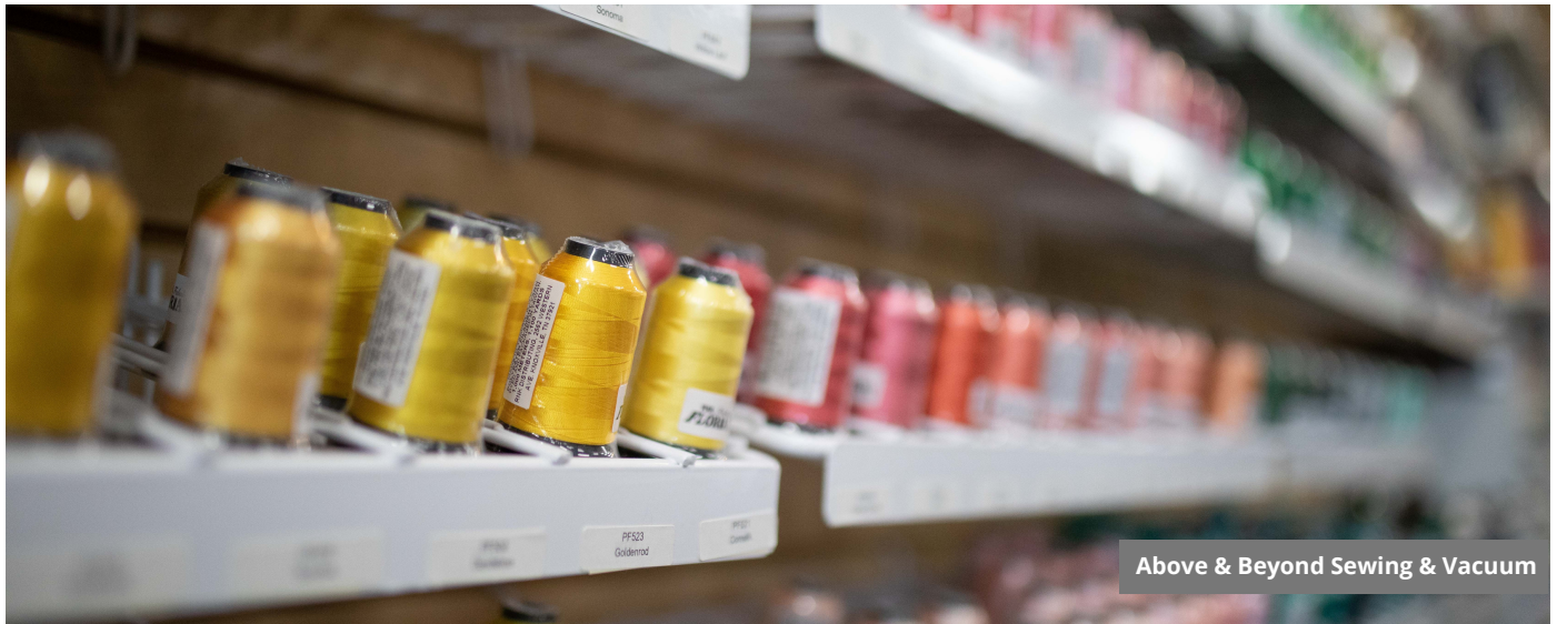
Above & Beyond Sewing & Vacuum