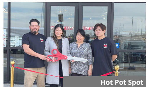
Hot Pot Spot