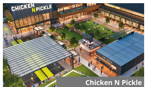
Chicken N Pickle