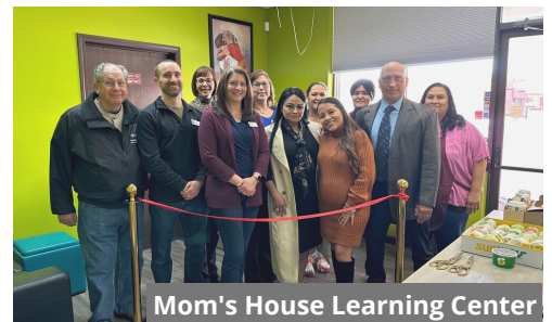
Mom's House Learning Center

Crumbl Cookies is opening a second location soon at 9770 Washington St.